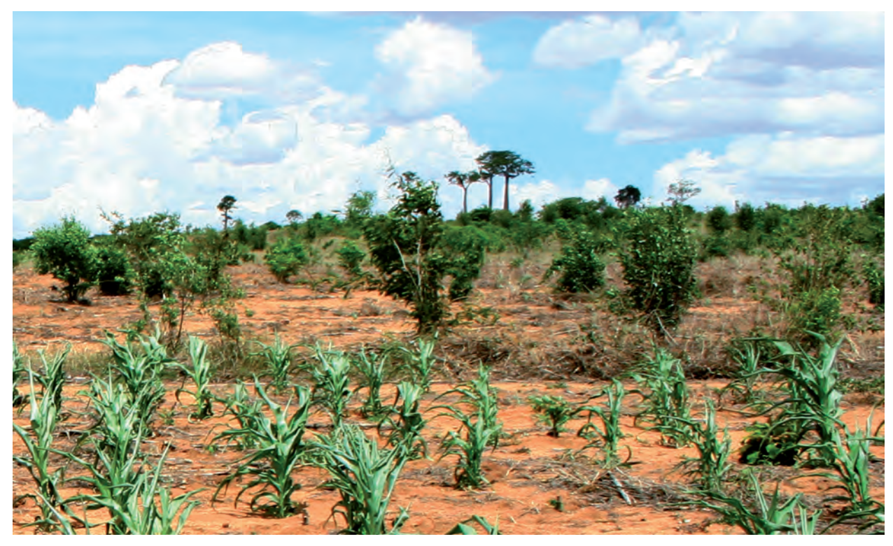
Fig. 1. Habitat of Voeltzkowia rubrocaudata : corn plantation (in foreground) near the village of Andranomaitso, Commune rurale de Sakaraha.

Table 1. Morphological measurements (all in mm) of specimens of Voeltzkowia rubrocaudata from southwestern Madagascar. Used abbreviations are: MRSN (Museo Regionale di Scienze Naturali, Torino), FAZC (Franco Andreone Zoological Collection, Field numbers), SVL (snout–vent length), TL (total lenght), VS (ventral scales), DS (dorsal scales), MBS (midbody scales).